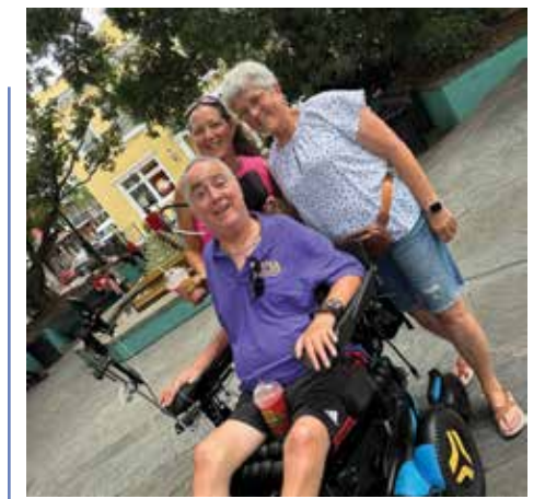
When not competing Members & Volunteers enjoyed the sites around New Orleans