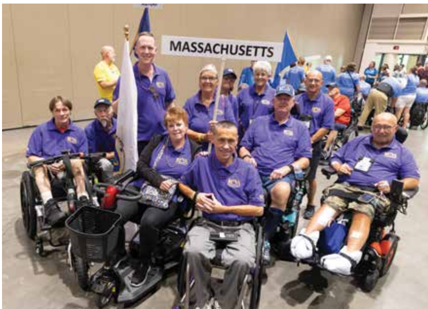
We marched into the convention center with the Massachusetts delegation and were met with thunderous cheers and applause from the many people in attendance.